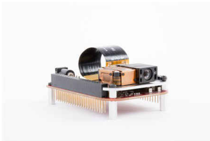
Figure 1. DLP LightCrafter™ Display DLP2000 EVM

To make our technology accessible to the masses, TI has introduced its most affordable digital micromirror device (DMD) and DLP EVM ever. The DLP LightCrafter™ display DLP2000 EVM enables you to evaluate DLP technology for $99. You can harness the technology as a stand-alone unit or pair it with your favorite low-cost processor. In stand-alone operation and powered by a 5V DC supply, the unit can display one image that showcases image quality, contrast ratio and photo/display panel imagery. Processor connectivity is enabled with a 16-/24-bit red-green-blue (RGB) parallel interface and I 2 C to communicate with the unit. In fact, the unit has the same pin out configuration as the BeagleBone Black.