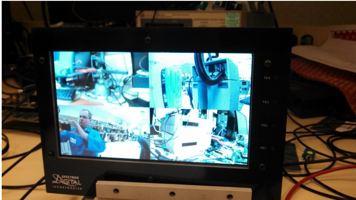
Figure 2 Screen image showing outputs from four cameras.