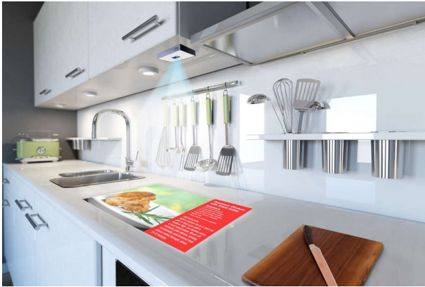
Figure 4. New ways to showcase a cooking video.

Recent additions to TI's family of 4K UHD DLP chipsets have made it the most comprehensive set of 4K UHD solutions in the industry shown below in Figure 5 . Each chipset has been optimized to meet the requirements of a particular segment of applications. The chipsets range from one optimized on size and power savings for portable applications; another is also small enough for portable systems but it provides even higher levels of brightness; and a third chipset generates the brightness needed in some of the most demanding projection applications.