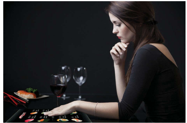
Figure 3. Interactive displays engage restaurant visitors.

Many signage solutions are not updated very often, even while the relevant information changes rapidly. Digital signage offers a method to display information as it changes in real-time. The digital signs in retail stores, for example, can communicate a change in a price for a special limited-time sale item. Or, they might respond to queries from shoppers. Still, flat panel digital signage is limited to just two dimensions—height and width. With DLP technology, projection displayed digital signs can compel engagement from the viewer, as seen in Figure 3 , with moving imagery or non-traditional display surfaces. The front window of a store in a shopping mall might become one massive video display without obscuring the view into the store in the background. Digital 4K UHD projection signage can range from real-time informative to the totally immersive, drawing viewers into the scene on display.