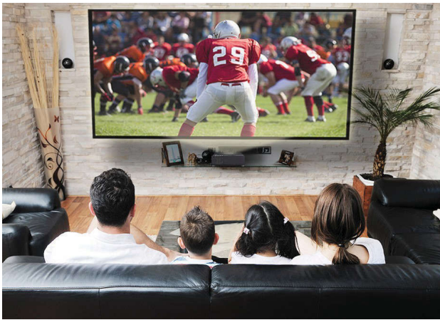
Figure 2. Laser TVs with ambient light rejection screens.