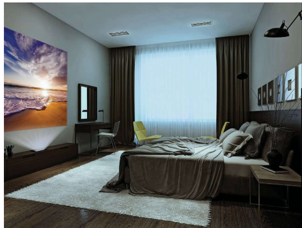
Figure 1. Mobile Smart TVs can be utilized in a variety of settings.

in a drawer or some other out-of-the-way place until needed. And for consumers who move often, a mobile smart TV is much easier than flat panel displays to pack and transport.