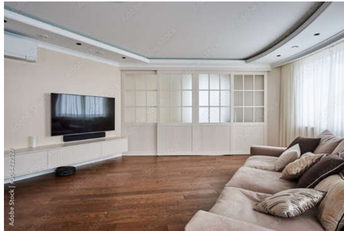
Figure 1. Example of Screen Glare on a Typical Flat Panel Display