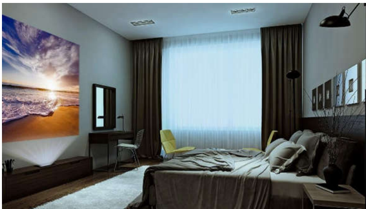
Figure 3. Laser TV Display Example

The latest DLP technology products enable features that are essential to gamers, creating a new market for laser TV's. The integration of TI's Single Springtip Torsional Pixel (SST) DMDs paired with advanced controller options in laser TVs supports higher refresh rates, lasting performance and lower input latency, meeting gamers' needs for fast-paced content.