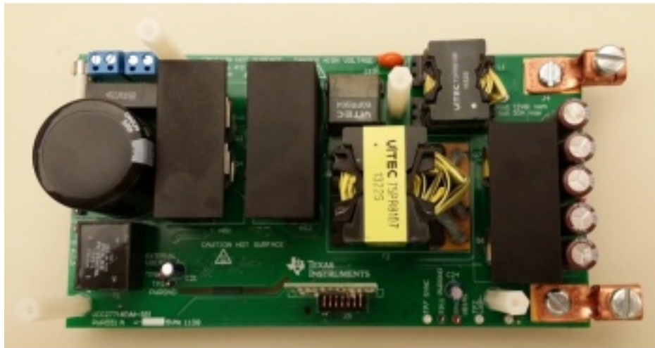
Figure 1. UCC27714 EVM Board

The UCC27714 EVM was designed to demonstrate how the UCC28950 control IC, UCC27524A and UCC27714 gate drivers could be used in a phase-shifted, full-bridge converter. The EVM consists of a power board and a control board. The control board carries a UCC28950 controller for which the UCC28951-Q1 is a pin-to-pin compatible drop-in replacement. Figure 1 is an image of the UCC27714 EVM.